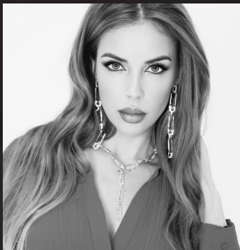
Director of the exhibition